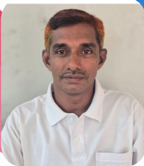
Shihab Pk Councillor